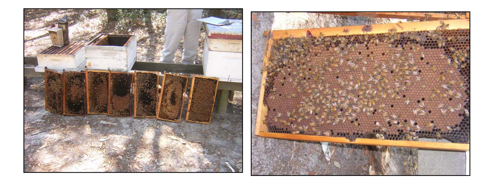
Figure 1 and 2: The rapid loss of adult honey bees is a defining feature of CCD. Here evidence of large sheets of brood are evidence that a large population of bees populated this colony in the last 14 days. The sparse remaining bee population appears to be mostly young adults.